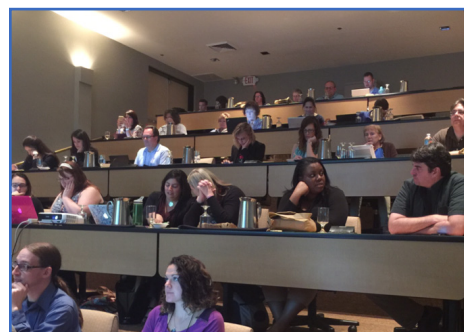
The Online College's presentation in Arizona had standing room only.