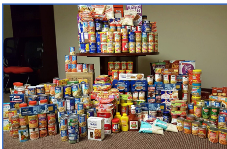
Canned goods and non-perishable food items collected by the staff at the SiMT.

The Southeastern Institute of Manufacturing and Technology (SiMT) collected more than 1,000 items, while the Bookstore collected more than 600 items, and Admissions and K-12 collected more than 400 items.