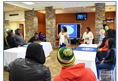
Students play Tech Feud in the 5000 Building's Student Lounge.