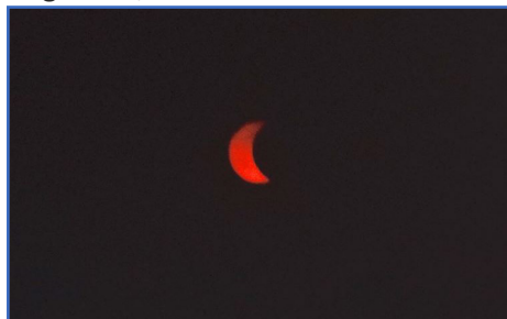
The solar eclipse near its maximum as it occurred over FDTC.

Students, staff and faculty took a break from their day-to-day tasks to enjoy the Great American Eclipse at Florence-Darlington Technical College (FDTC) on Monday, August 22, 2017.