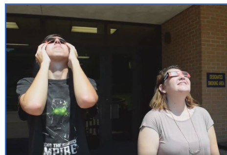
Students gathered at the 5000 Building’s fountain on the front of campus to view the rare solar eclipse that moved across the country on Monday, August 21, 2017.

Everyone at the college stepped outside and stared at the solar eclipse that reached its maximum around 2:47 p.m. The college went from a bright partly cloudy day to a dim, eerie afternoon once the moon moved in front of the sun. It got just dark enough for the 5000 Building’s parking lot lights to automatically come on.