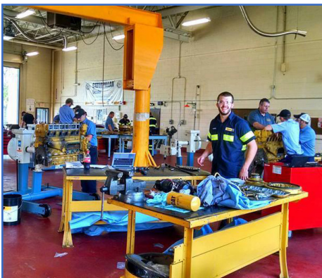
Students working in the Caterpillar Dealer Academy located on Florence-Darlington Technical College's main campus.

gram is required to be sponsored by a dealer.